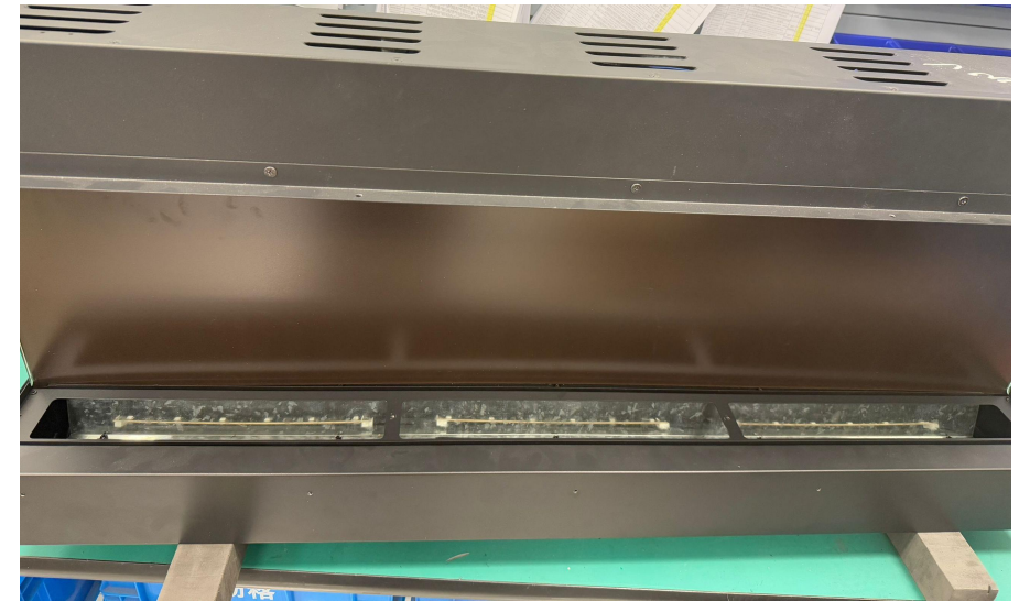
Photo after removing the plastic try.