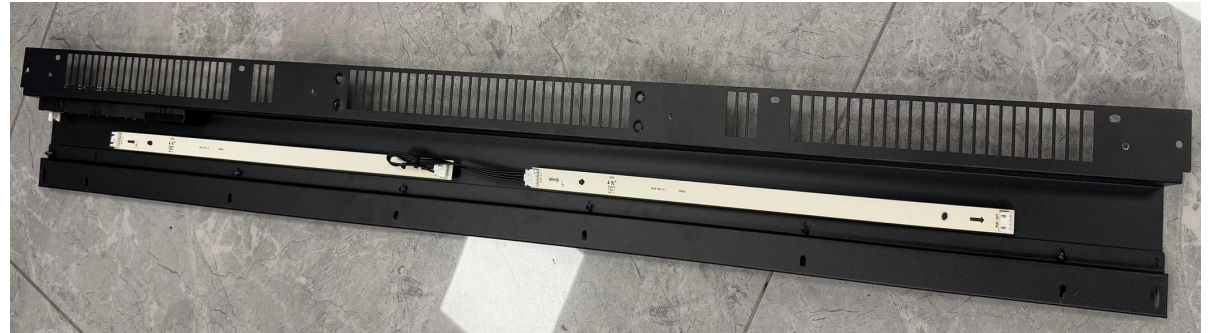
The air outlet panel.